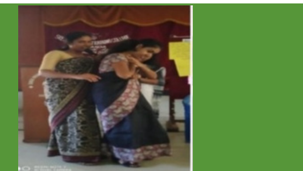
Students performing health tips